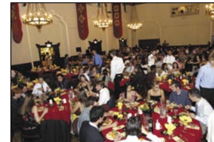
The Sunday Supper tradition features student performances and allows for dialogue and discovery among alumni and current residents.

"You feel at the nerve center of a thriving global community. Instead of watching life happen on TV, you're in it."