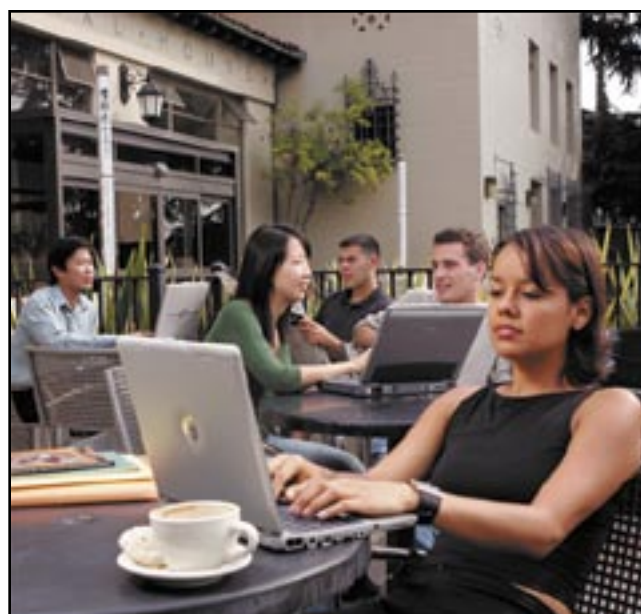
Residents enjoy wireless internet access on the Homburger Terrace and a range of residential computer services provided by the I-House Office of Information Technology.