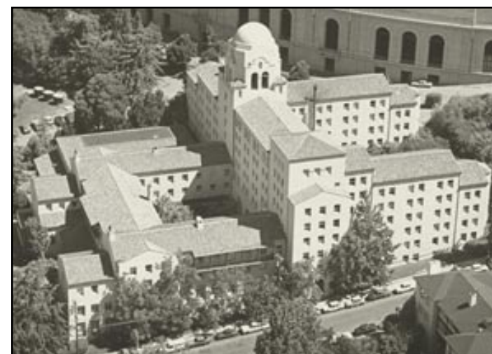
Encompassing 240,000 square feet, this 75-year-old building requires constant vigilance to protect its unique service and purpose.

Donors to the Architectural Heritage Fund will enable our faithful stewardship of this facility: replacing dangerously outdated systems, improving safety and comfort, and taking preventative steps to avoid future costly renovations.