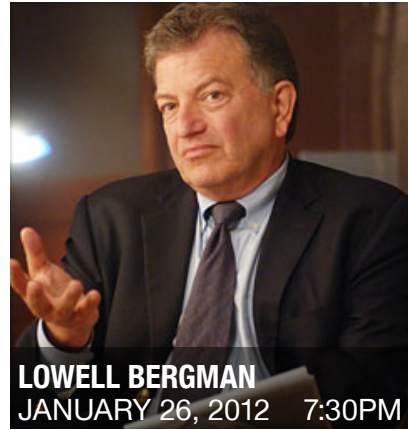
LOWELL BERGMAN JANUARY 26, 2012 7:30PM

Acclaimed New York Times reporter and 14 year veteran producer of 60 minutes, Lowell Bergman, whose tobacco investigation was portrayed in the film The Insider , is renowned for his in-depth investigative reporting on issues ranging from organized crime, international arms dealing, drug trafficking, and the Iran-Iraq and Persian Gulf wars. Mr. Bergman, a distinguished professor at UC