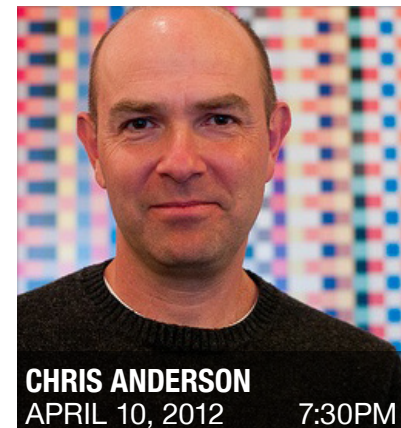
CHRIS ANDERSON APRIL 10, 2012 7:30PM

Chris Anderson, Editor-in-Chief of Wired Magazine , will discuss a new form of entrepreneurship taking root around the world. People are applying the Web's social and innovation models to DIY "small batch" manufacturing, leading to what Mr. Anderson calls "the continuing industrialization of the Maker Movement". Author of Free: The Future of a Radical Price and The Long Tail: Why the Future of Business Is Selling Less of More , Mr. Anderson is will also speak to his experience leading DIY Drones, an open source hardware and robotic community, and will take questions from the audience.