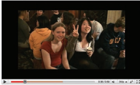
“ I think I-House is the best place for networking and making friends.”