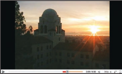
Unspoken artistic and romantic images set to music honor the beauty of the I-House Experience (see for yourself!)