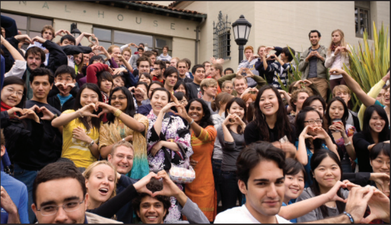
Residents from around the globe put their hands together in the shape of hearts in this photo taken on the I-House steps. With alumni support and through new intercultural skills trainings, I-House works to extend empathy and understanding (and sometimes love!) across cultures.

A resident room naming program launched five years ago has established thirty-three such designations securing philanthropic support that maintains our historic building while establishing plaques that honor former inhabitants and inspire current residents.