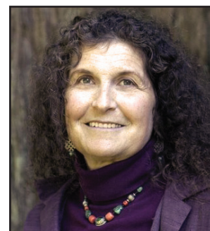
Alumna Arlene Blum spoke to alumni and residents at the spring Lodestar program.

Mountaineer, author, and biophysical chemist Dr. Arlene Blum spoke at the March Lodestar dinner program attended by alumni, friends, and residents. Blum reflected on her deep ties to International House. Not only did she live in the House in 1967-68 but her parents met at I-House Chicago.