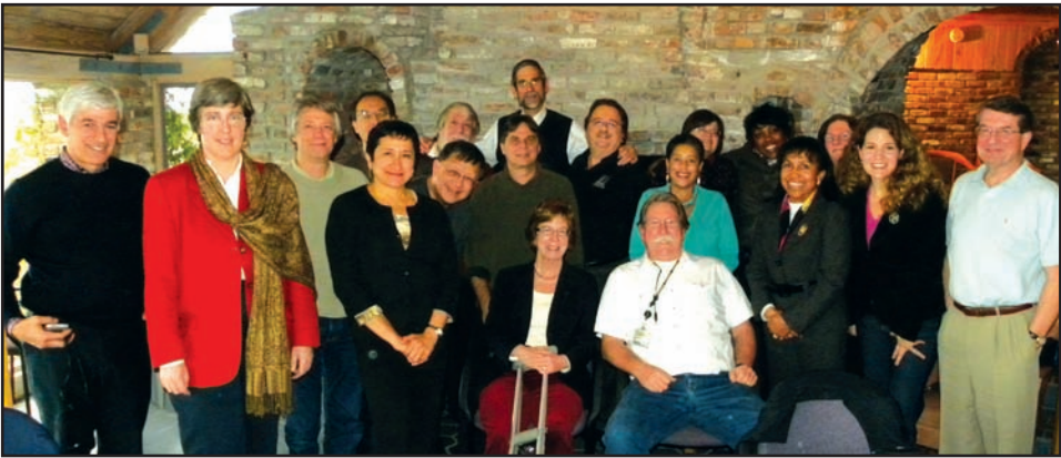
I-House Board members gathered with senior staff off-site in February to discuss strategic imperatives for the future of International House, Berkeley.

mission effectively and with efficiency." Two major themes of the plan focus on refining customer service while enhancing the quality of the I-House experience for residents and guests, as well as evaluating ways to operate with greater efficiency in using resources, including staff and time. The fall I-House Times will provide an update on the final plan and related actions.