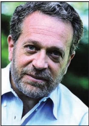
Economist Robert Reich, keynote speaker

in the Great Hall, I-House Café, and the Heller Patio. Resident hosts, including scholarship recipients who directly benefit from Gala donations, welcomed guests and shared insights regarding highlighted cultures and their traditions.