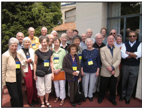
Cal Alumni at the 2009 Exploritas Program

with participants interested in international issues. The schedule includes two morning lectures; afternoon tours; three evening